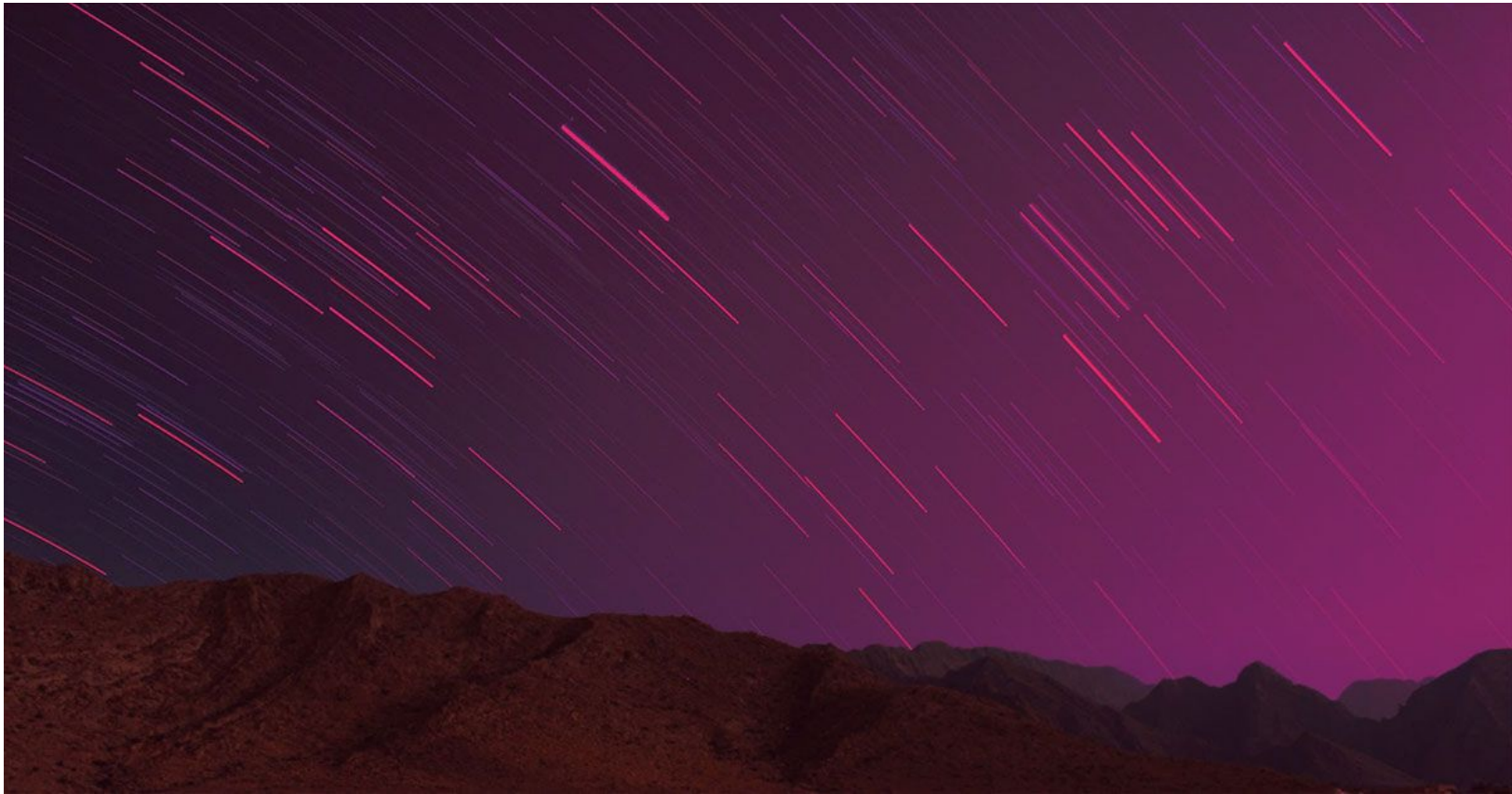
Big Bend National Park, Texas